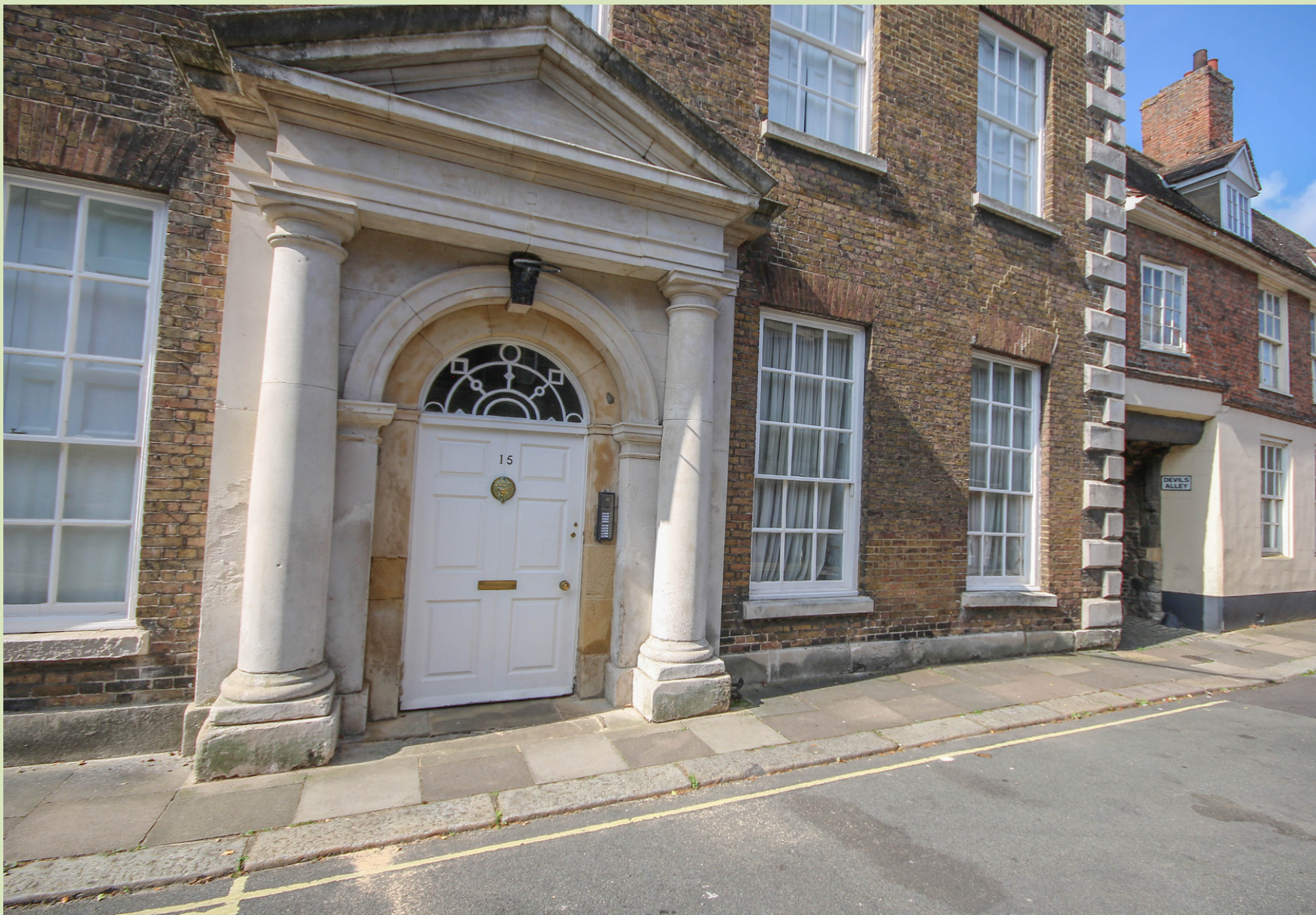
Corn Chambers, Lath Mansions, King's Lynn Guide Price £150,000