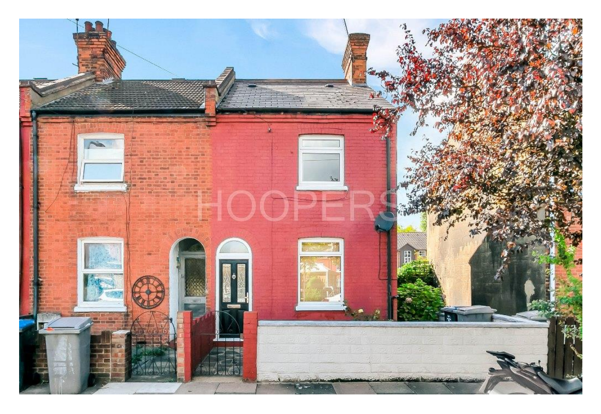
EPC Rating: D

We are pleased to present for sale this fabulous end of terrace well maintained family house and located parallel to Woodheyes Road just off the A406 (North Circular Road). Benefits include:-