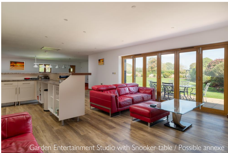
Garden Entertainment Studio with Snooker table / Possible annexe