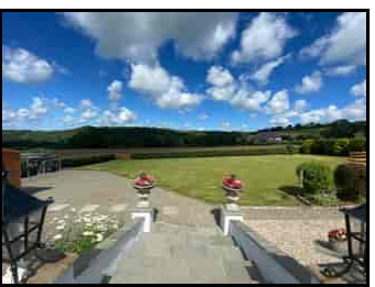
Efailwen Penrhiwllan, Llandysul, Ceredigion. SA44 5NT.