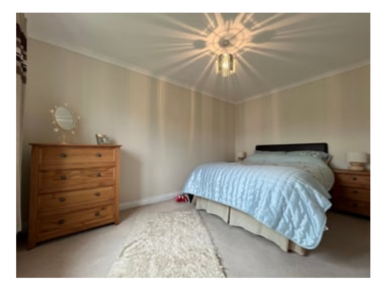
Rear Bedroom 4

13' 7" x 8' 9" (4.14m x 2.67m) with central heating radiator