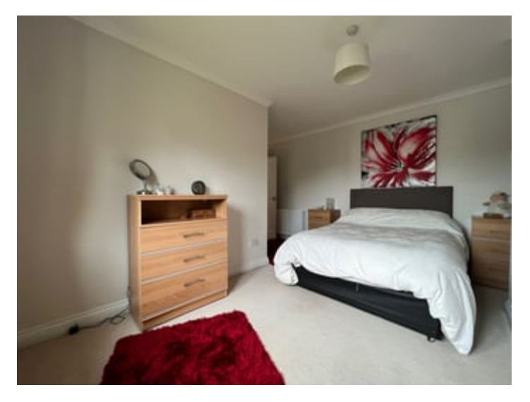
Front Bedroom 3

13' 9" x 9' 4" (4.19m x 2.84m) plus 6' x 5'2" L-shaped with central heating radiator