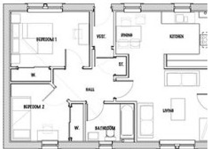
FLOOR PLAN Footprint area = 74.89sqm

Buckhaven its self offers a good central location for commuting with Leven, Kirkcaldy and Glenrothes being only a short drive away. Additional the area now has two new railway stations and offer rail transport to Edinburgh and a selection of Fife Towns.