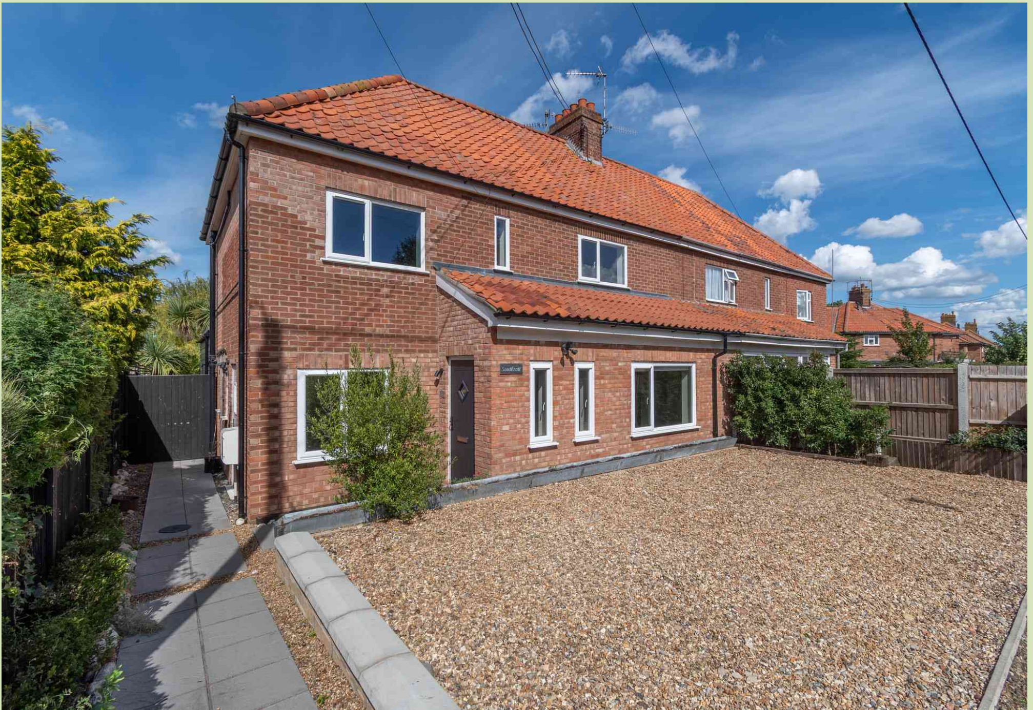
Southcott, Wells-next-the-Sea Guide Price £525,000