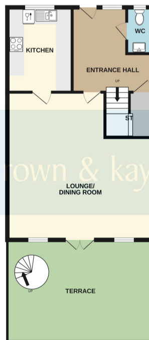
GROUND FLOOR 616 sq.ft. (57.2 sq.m.) approx.