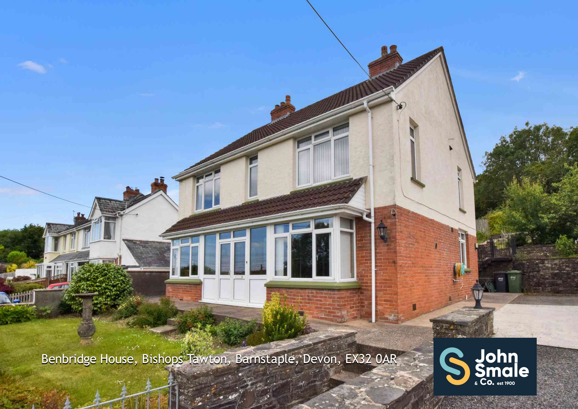
Benbridge House, Bishops Tawton, Barnstaple, Devon, EX32 0AR