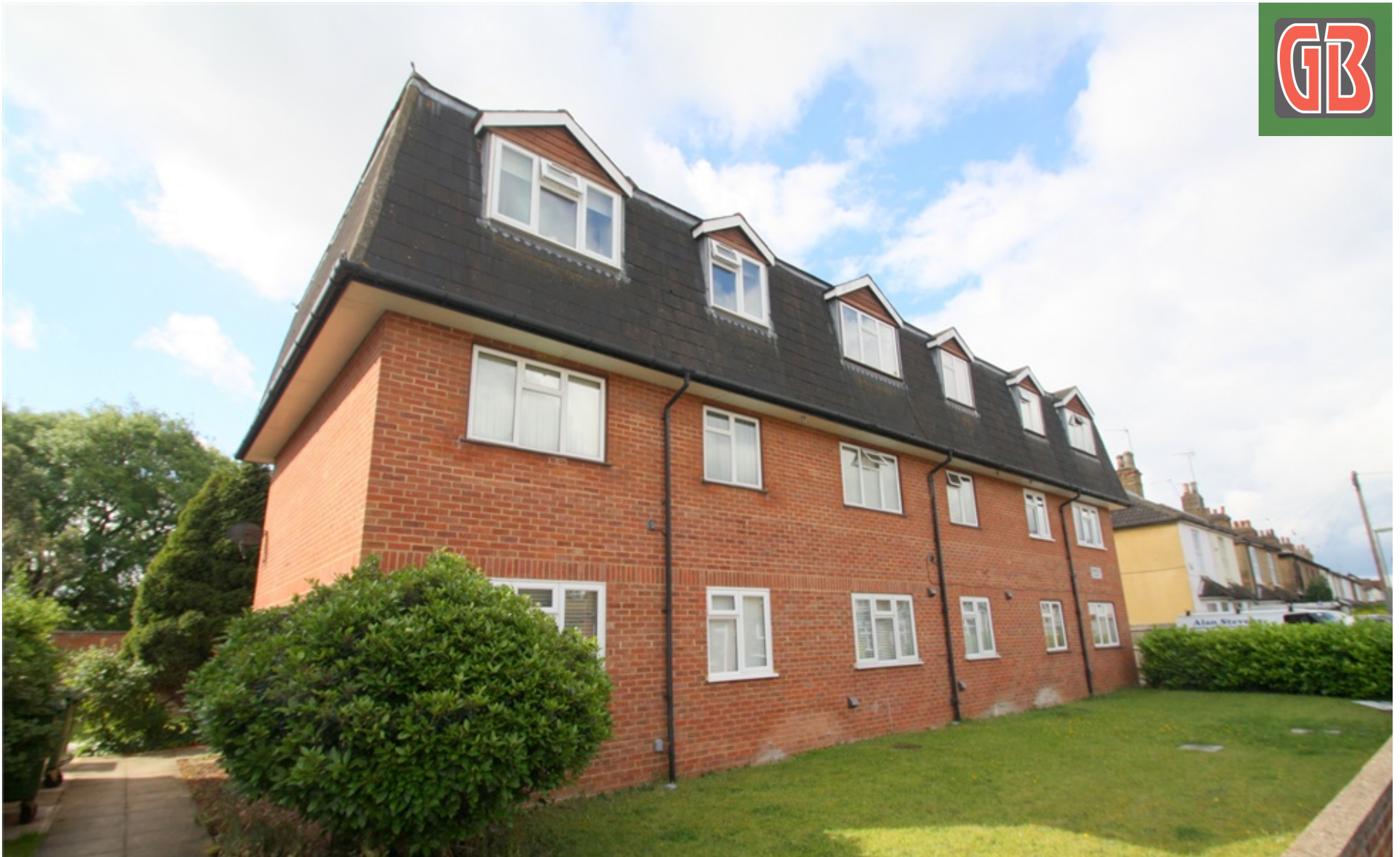
11 Hermitage Court Edgell Road, Staines-upon-Thames. TW18 2DR. 1 Bedroom Apartment - £210,000 Leasehold