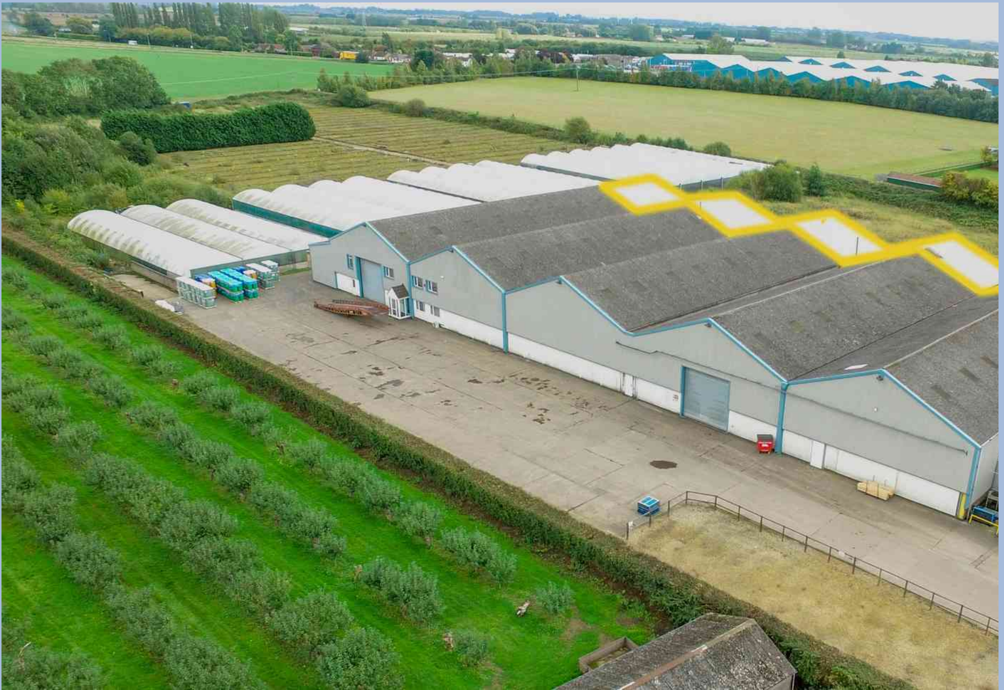
Unit A East Coast Storage, Wisbech £45,000 Per Annum