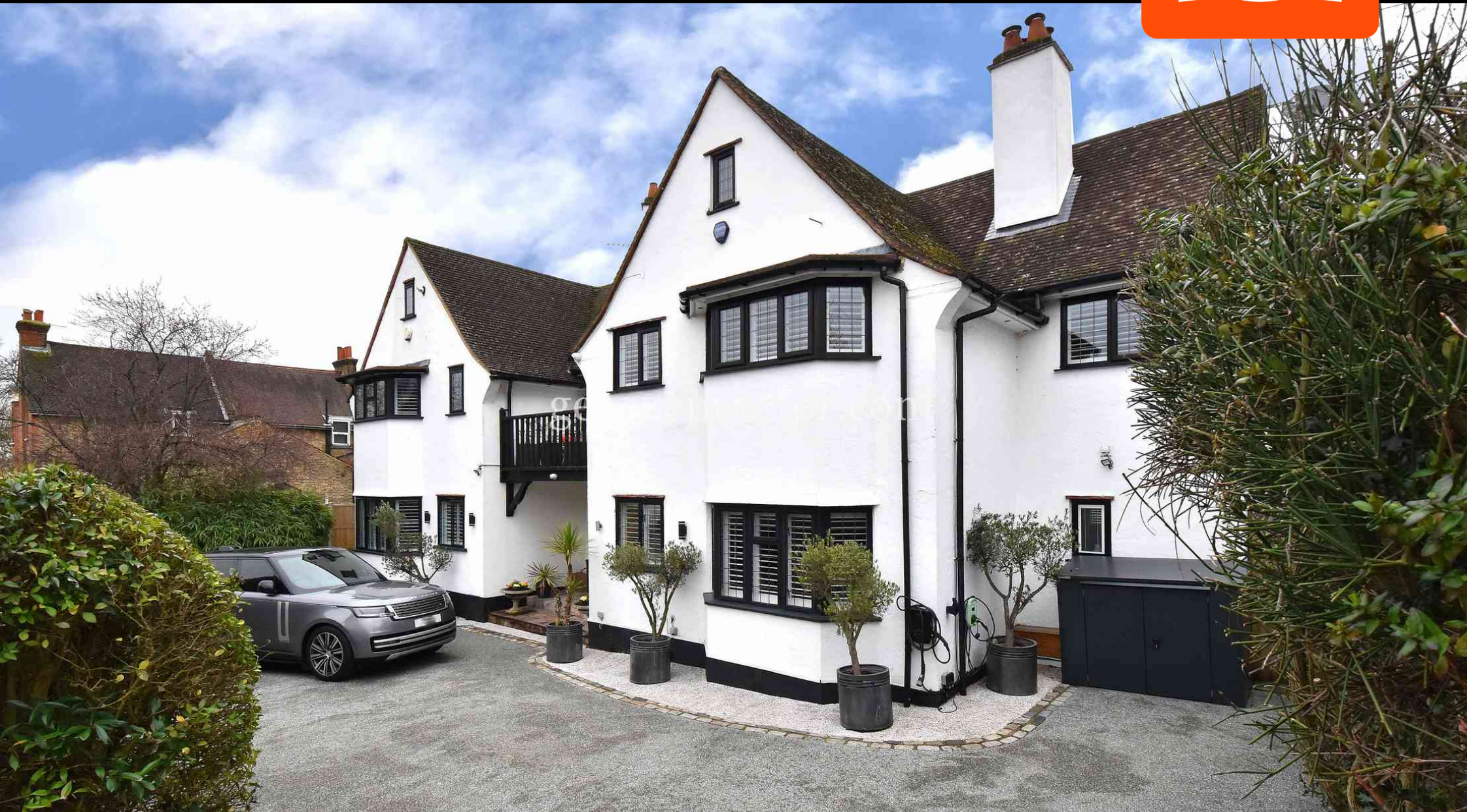
Shawfield Park, Bickley, Kent. BR1 2NQ