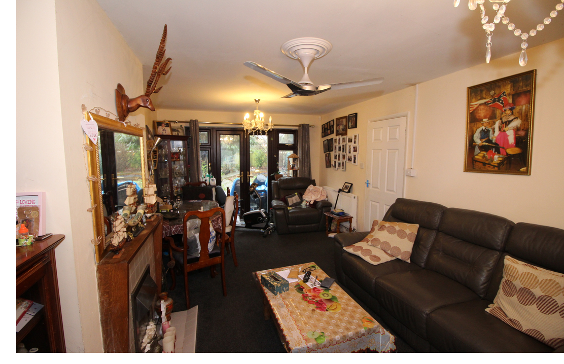
10 Fairways, Ashford, Surrey TW15 2AA £439,950 - Freehold