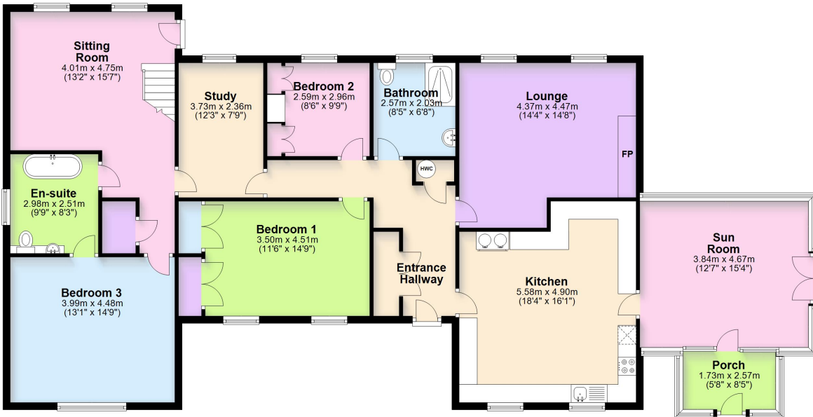
Ground Floor Approx. 175.2 sq. metres (1885.4 sq. feet)