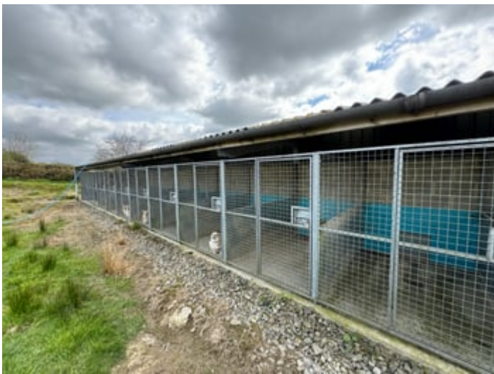
15' 0" x 60' 0" (4.57m x 18.29m) of steel frame with block and box profile walls providing 11 kennels and dog run areas with concrete base and water and electric connection.