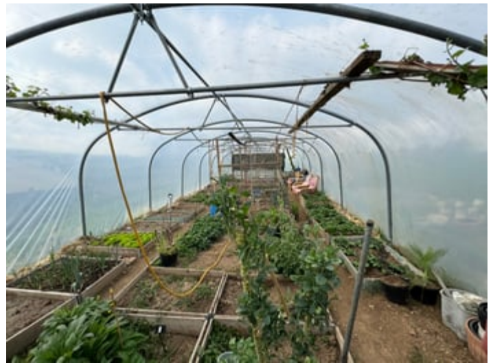
50' 0" x 19' 0" (15.24m x 5.79m) set above the steel frame building being 50' x 19' and accessed from the track that leads to the adjoining fields, currently house red, white and rose grapes and a range of vegetables.