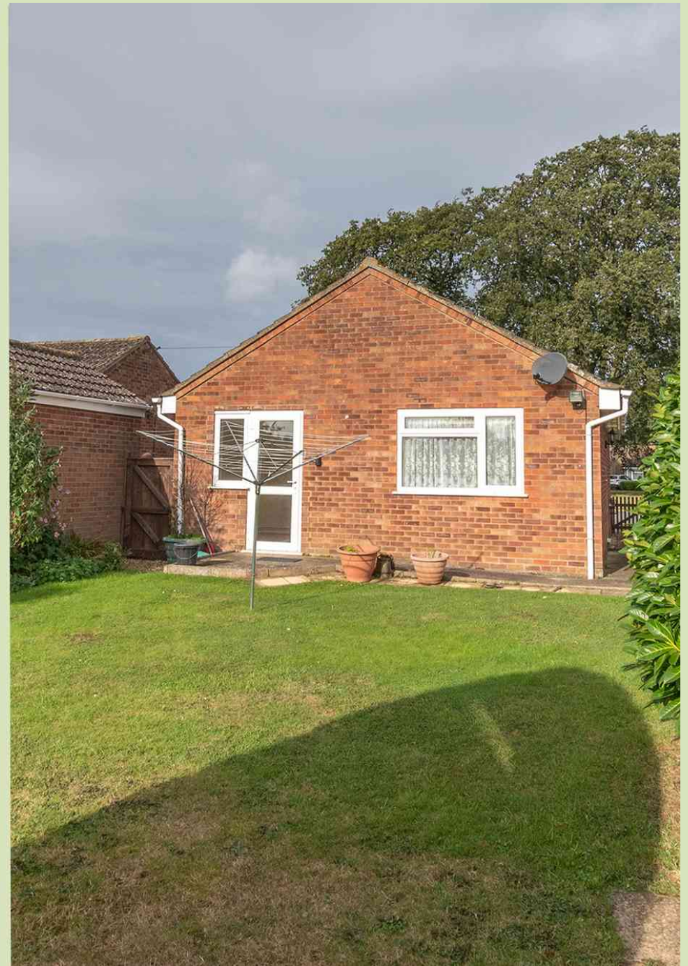
3 Windsor Crescent, Heacham Guide Price £250,000