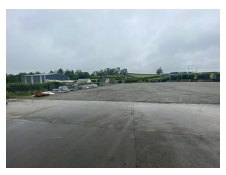
FORECOURT AND FORE YARD