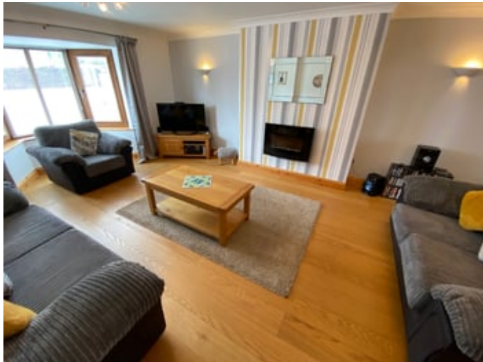
LIVING ROOM (SECOND IMAGE)