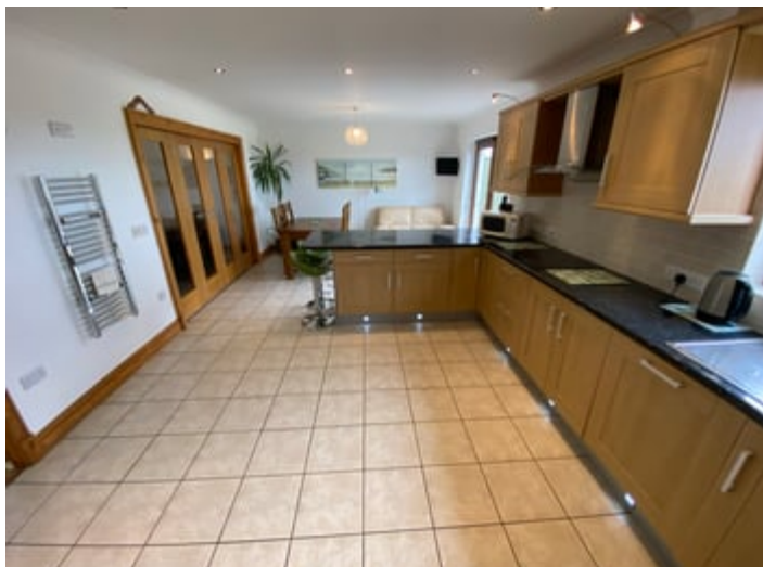
KITCHEN/DINER (SECOND IMAGE)

9' 4" x 8' 8" (2.84m x 2.64m). With a half glazed UPVC rear entrance door to the rear decking area, floor cupboards, stainless steel sink and drainer unit, plumbing and space for automatic washing machine, courtesy door from the Utility Room to the Integral Garage.