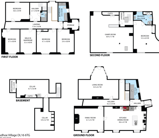
Tudhoe House, Tudhoe Village DL16 6TG TOTAL APPROX. FLOOR AREA 454 SQ.M Measurements shown are approximate and no responsibility is taken for any error, omission, or misstatement. This plan is for illustrative purposes only and should be used as such by any prospective purchaser.