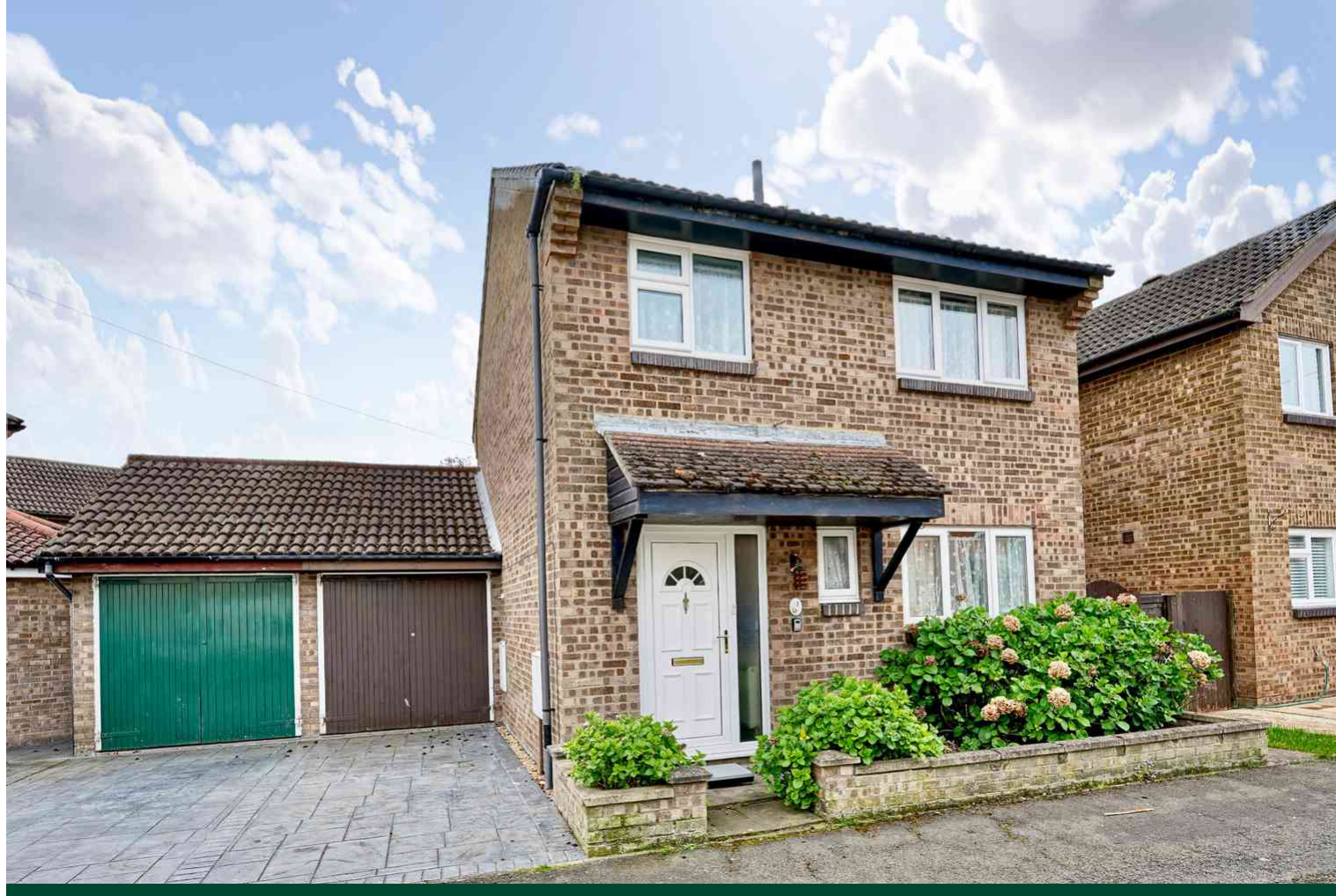
Wheatsheaf Road, Alconbury Weston PE28 4LF