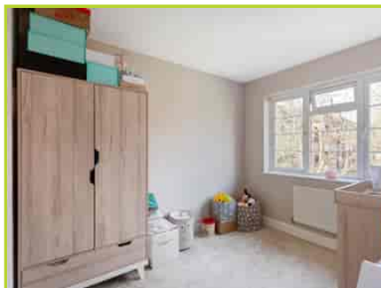
16 Broadlawns Court, HARROW, Middlesex. HA3 7HN. £385,000 Leasehold

Located within this quiet cul-de-sac this two double bedroom maisonette features a lovely reception room, modern fitted kitchen and bathroom, own part of rear garden and garage. Internally the property is in excellent condition and internal viewing is highly recommended.