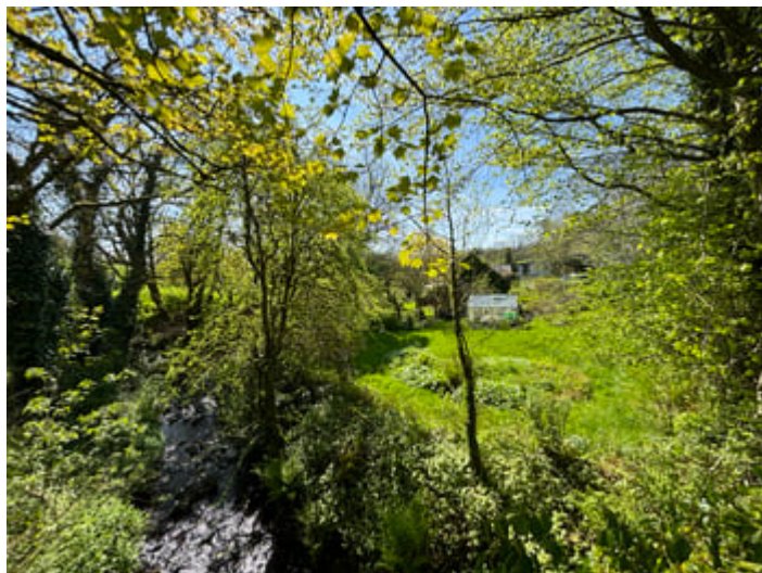
STREAM (SECOND IMAGE)