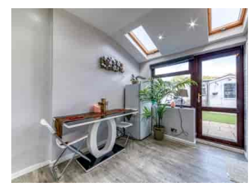
Saffron Close, Croydon, Surrey, CR0 3GT