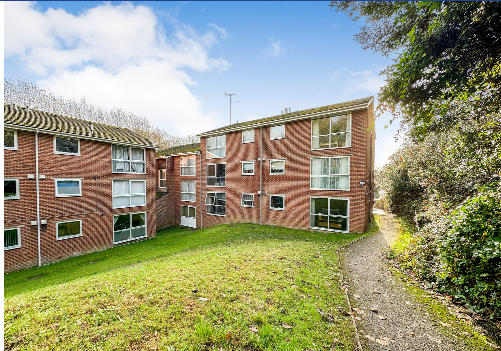
Josephine Court, Southcote Road, Reading.