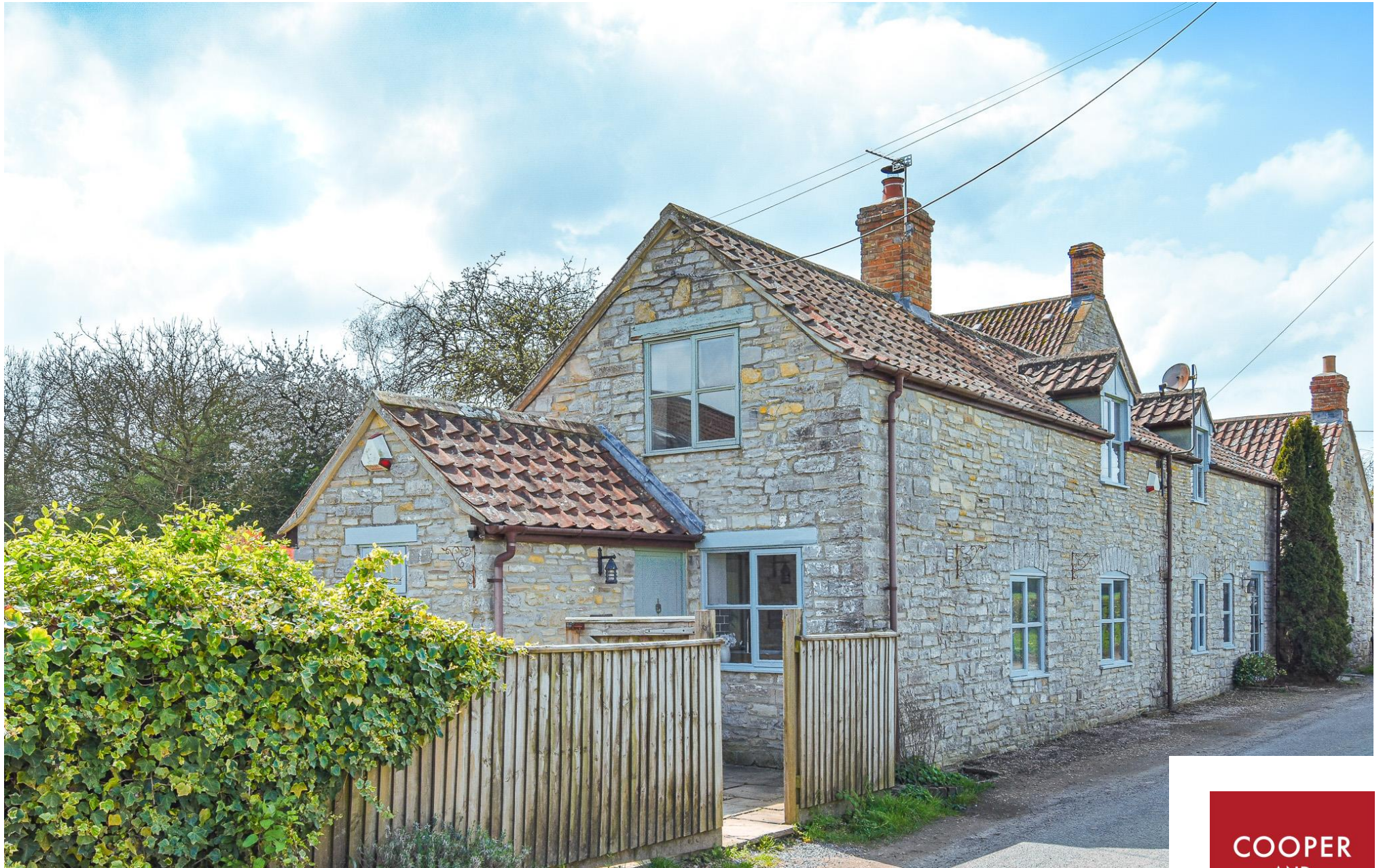
Little Ireland Cottage, Little Ireland, Wedmore BS28 4BJ