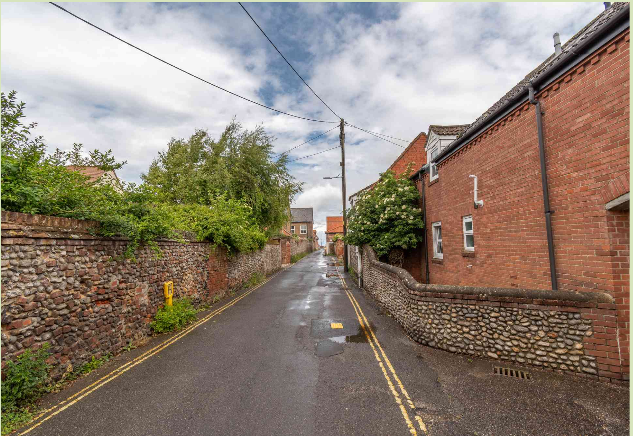
11 Eagles Court, Wells-next-the-Sea Guide Price £180,000