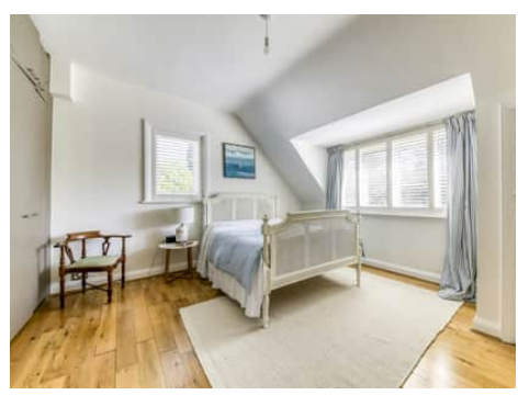
Croham Park Avenue, South Croydon, Surrey, CR2 7HH