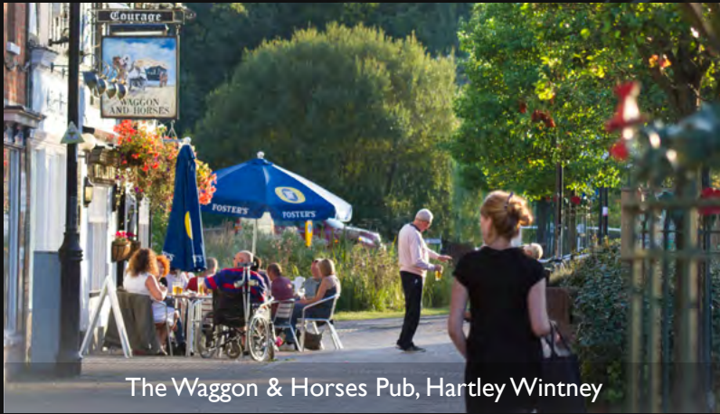
The Waggon & Horses Pub, Hartley Wintney

Nearby larger shopping experiences can be found in Basingstoke and Reading, with London less than 40 miles away also.