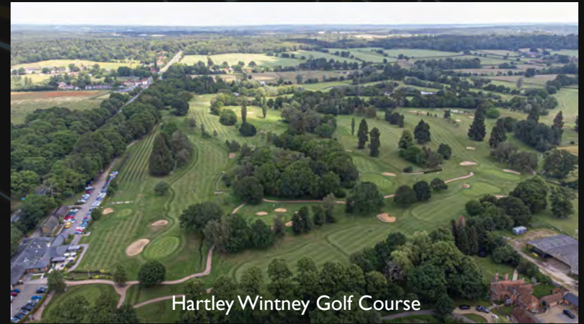
Hartley Wintney Golf Course