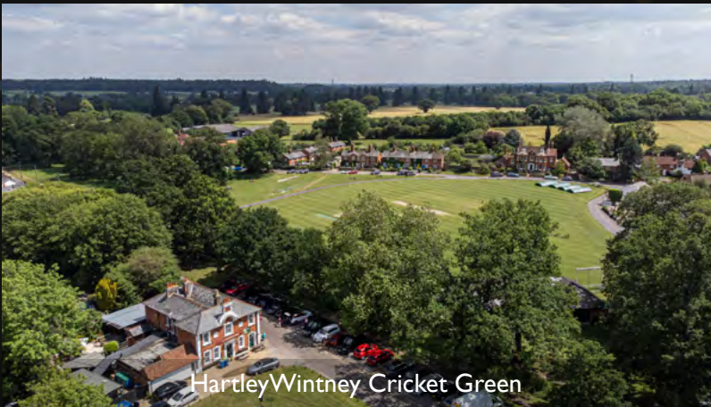
Hartley Wintney Cricket Green