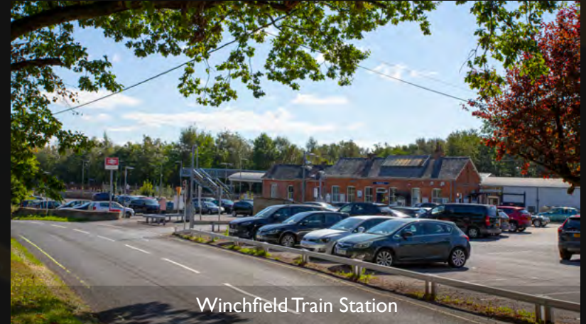
Winchfield Train Station