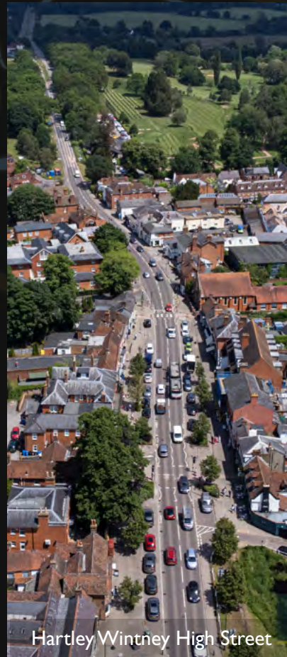
Hartley Wintney High Street