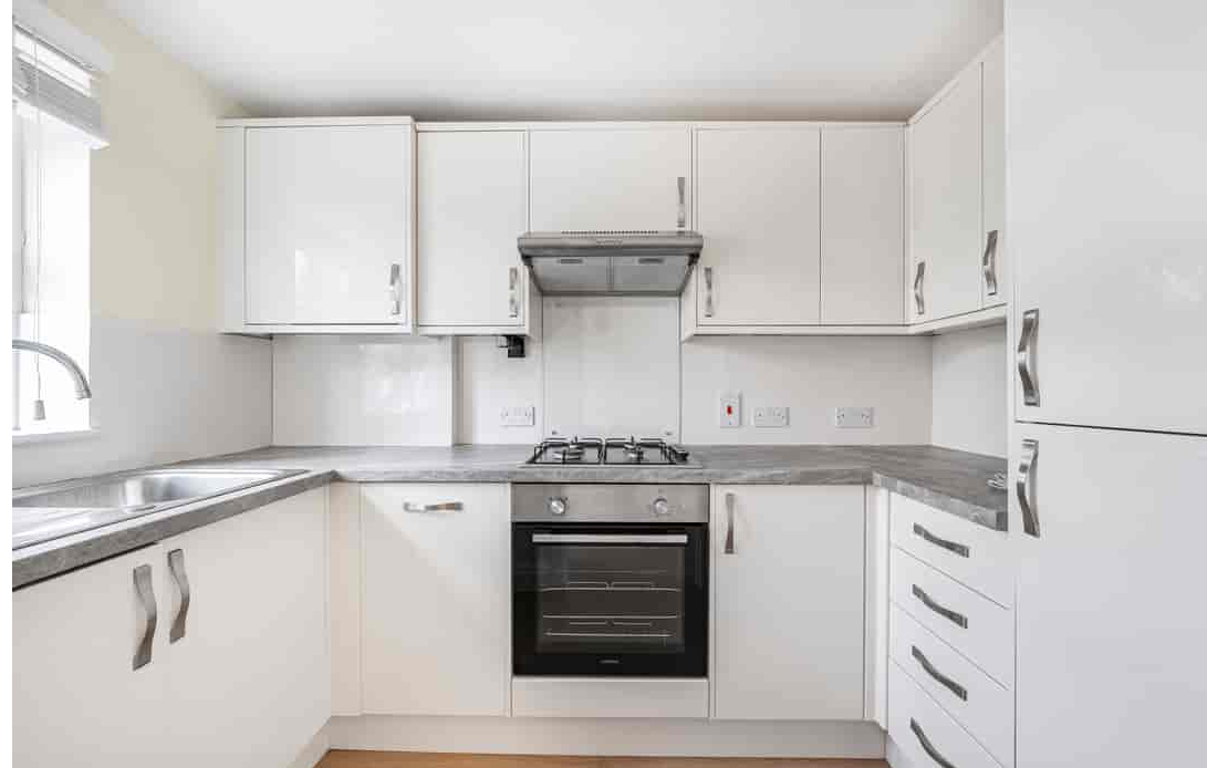
1 Willowbank, Marlow Bottom, Marlow, Buckinghamshire SL7 3NB Guide Price £475,000 - Freehold