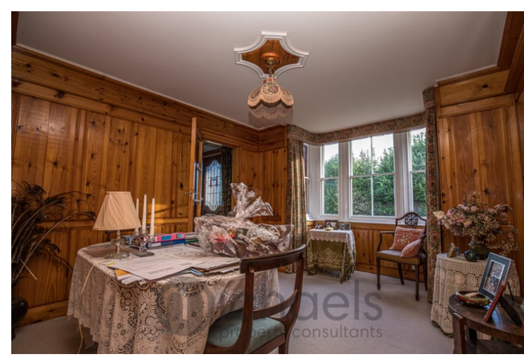
13' 3" x 10' 10" (4.04m x 3.30m)