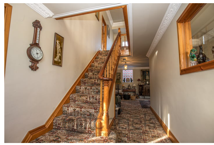
10' 5" x 7' 3" (3.17m x 2.21m)