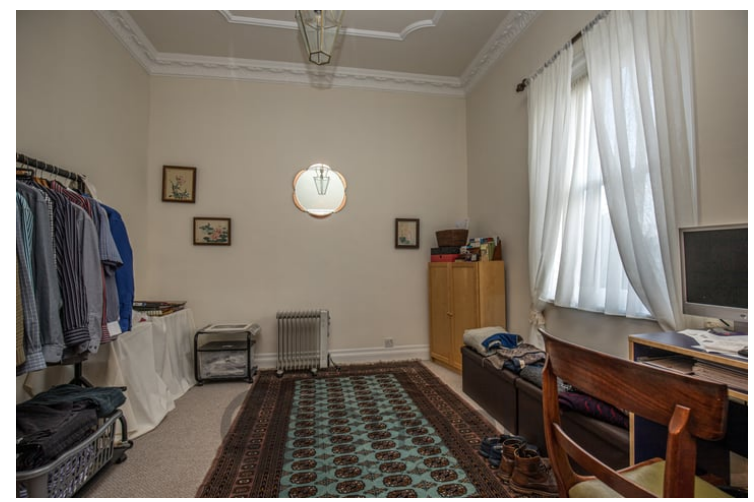
13'7" x 11'10" (4.14m x 3.61m)