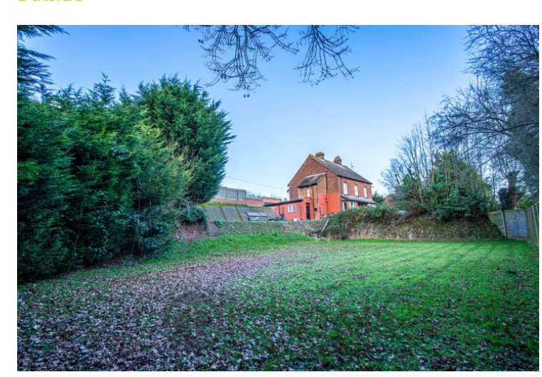
Outside, as previously mentioned the property comes with some beautiful front and side gardens. The main garden is south facing and offers an excellent space to relax and entertain friends. There is also a further sunken tennis court which is currently not in use. The large paved driveway provides ample off road parking.