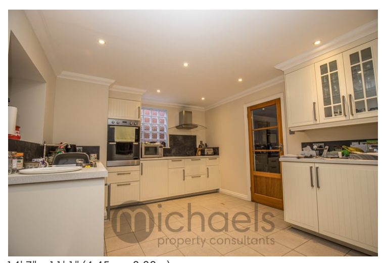
14' 7" x 11' 1" (4.45m x 3.38m)