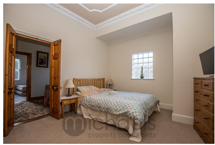
13' 7" x 11' 2" (4.14m x 3.40m)