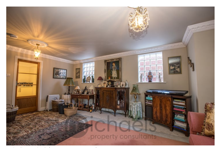
19' 6" x 13' 6" (5.94m x 4.11m)