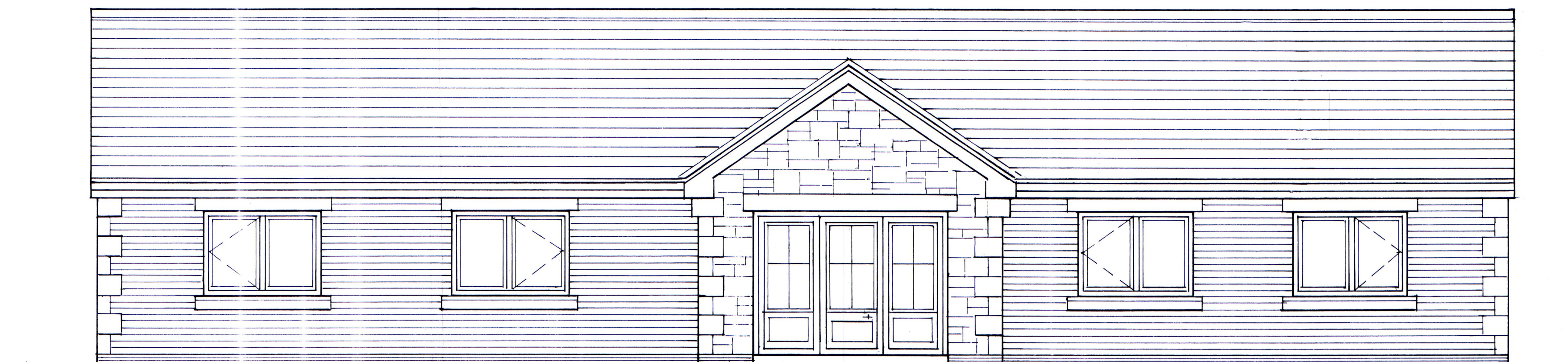
Front Elevation SW.