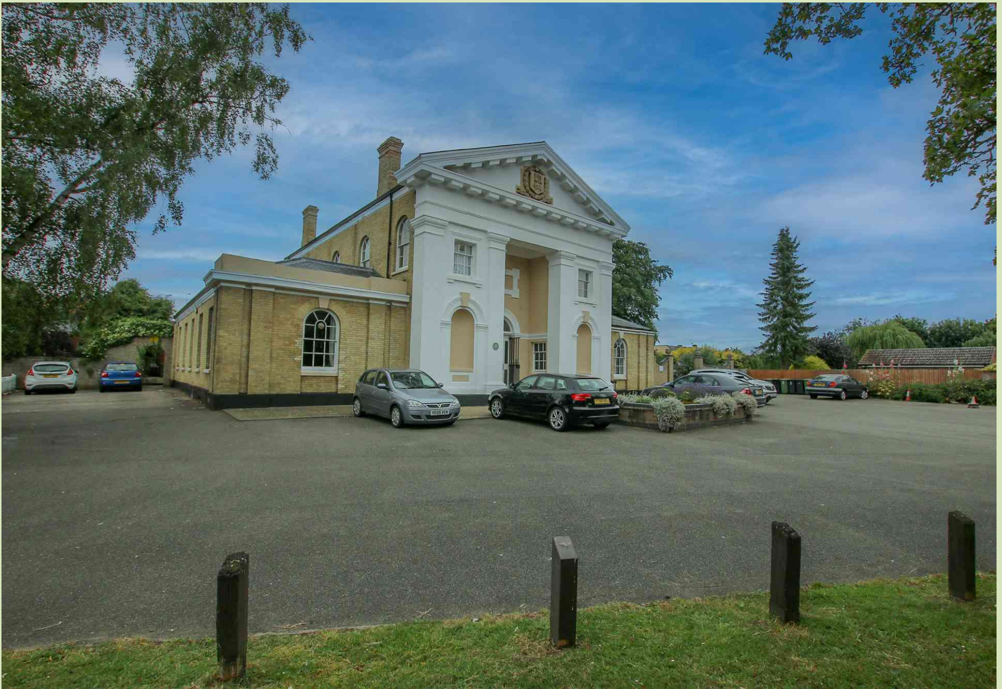
Flat 5, Shire Hall Beech Close, Swaffham, Guide Price £110,000