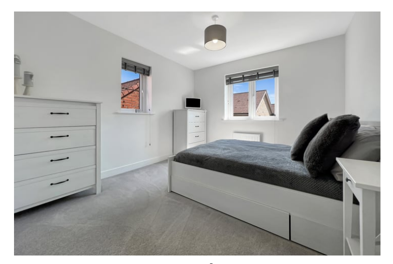
11' 6" x 10' 4" (3.51m x 3.15m)