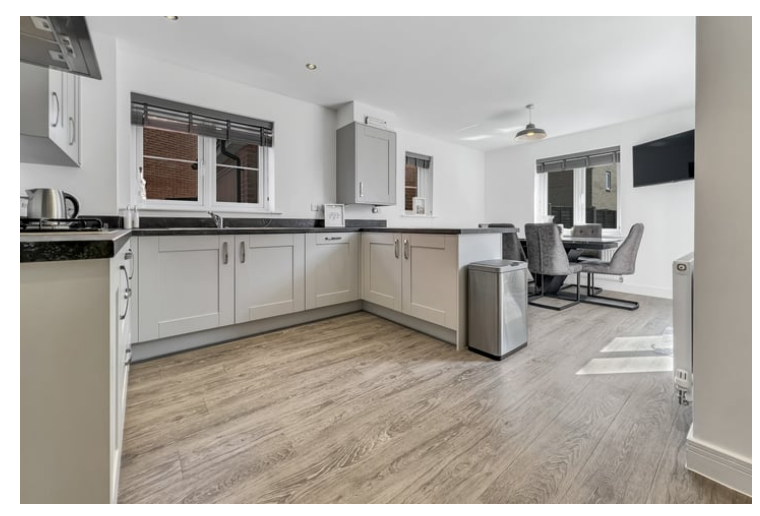
19' 3" x 14' 8" (5.87m x 4.47m)