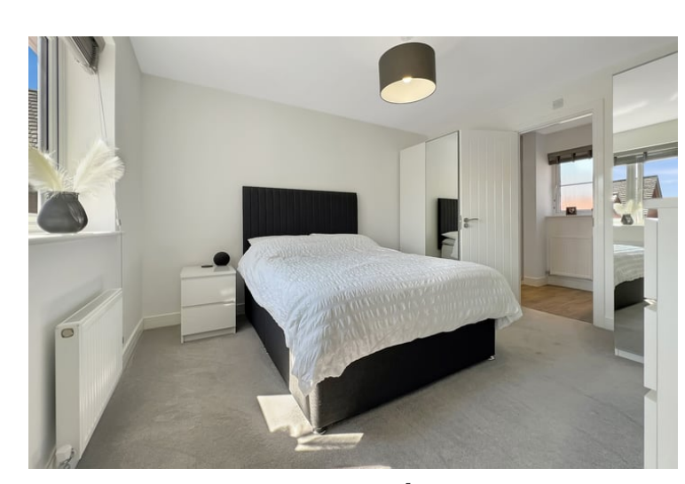
11' 10" x 11' 0" (3.61m x 3.35m)