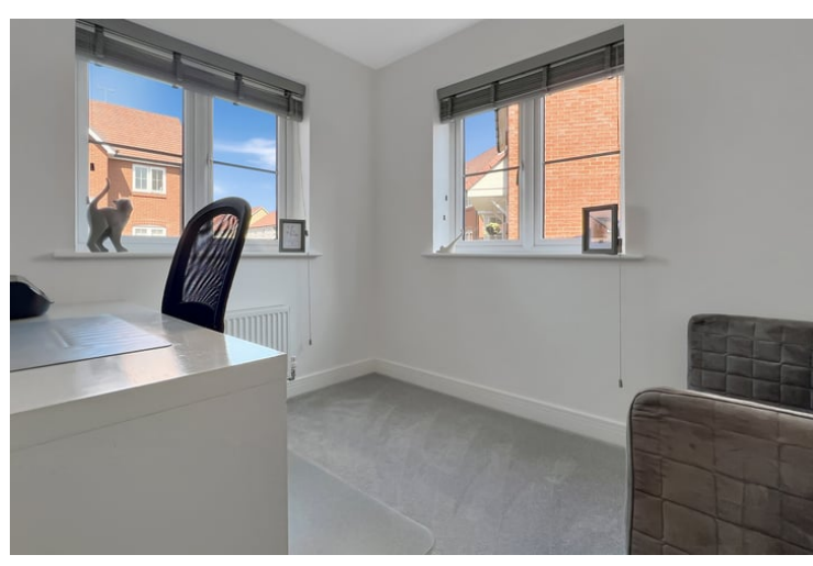
9' 3" x 7' 7" (2.82m x