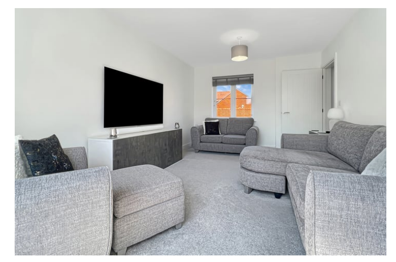
17' 0" x 10' 10" (5.18m x 3.30m)