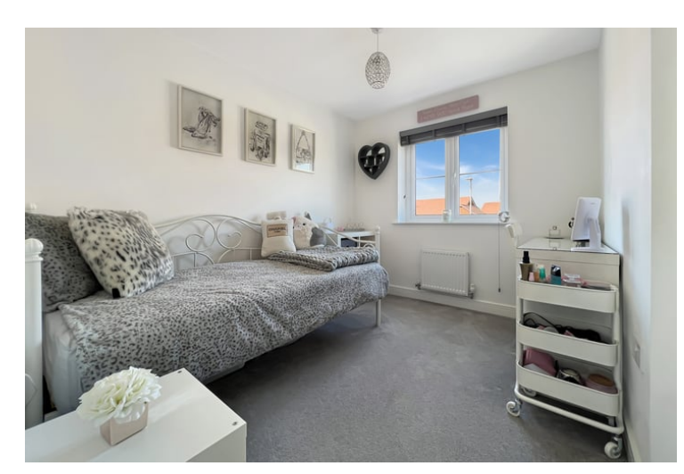
9' 10" x 9' 0" (3.00m x 2.74m)