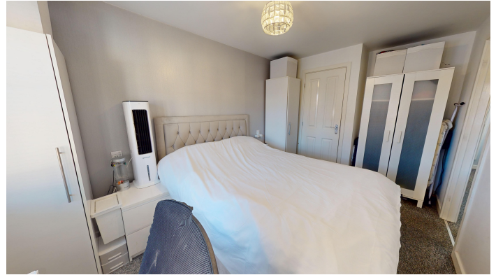
Master Bedroom and En Suite