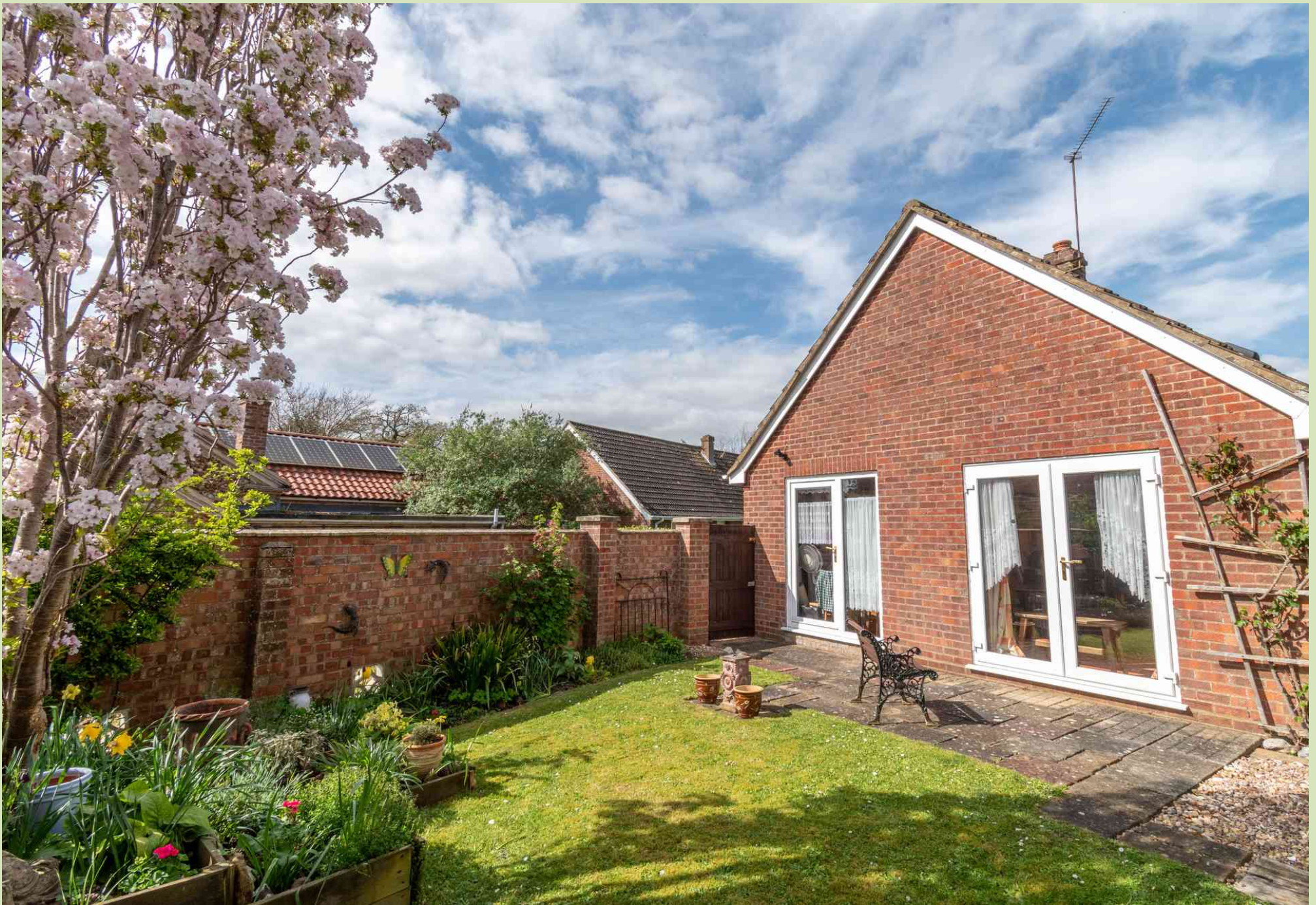
19 Peakhall Road, Tittleshall Guide Price £188,000