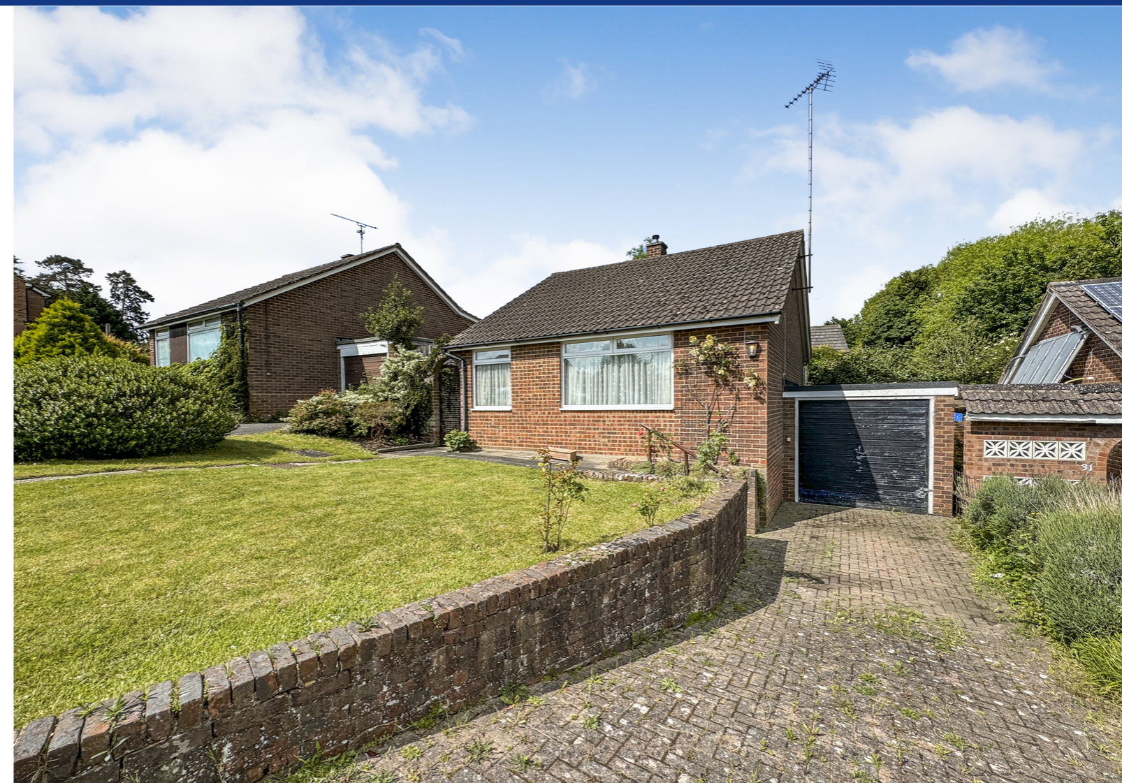
Stoneham Close, Tilehurst, Reading.