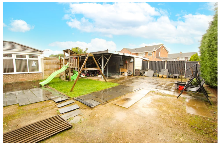
Property Information Form