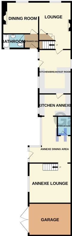
GROUND FLOOR 1192 sq.ft. (110.7 sq.m.) approx.