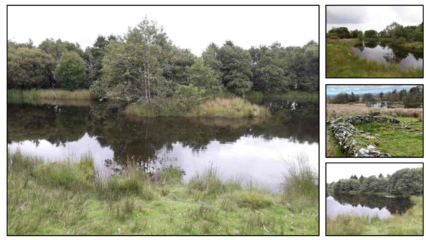
Gwar-Ffynnon Mountain Land Cellan, Lampeter, Ceredigion. SA48 8JA.