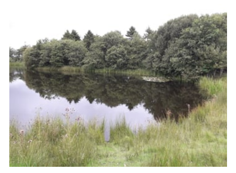
LAKE SETTING (SEVENTH IMAGE)