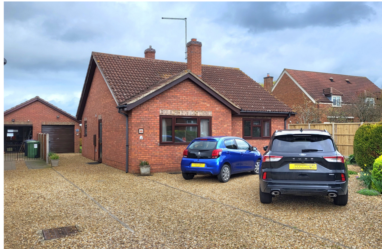
33 Hawthorn Close, Newborough PE6 7QY