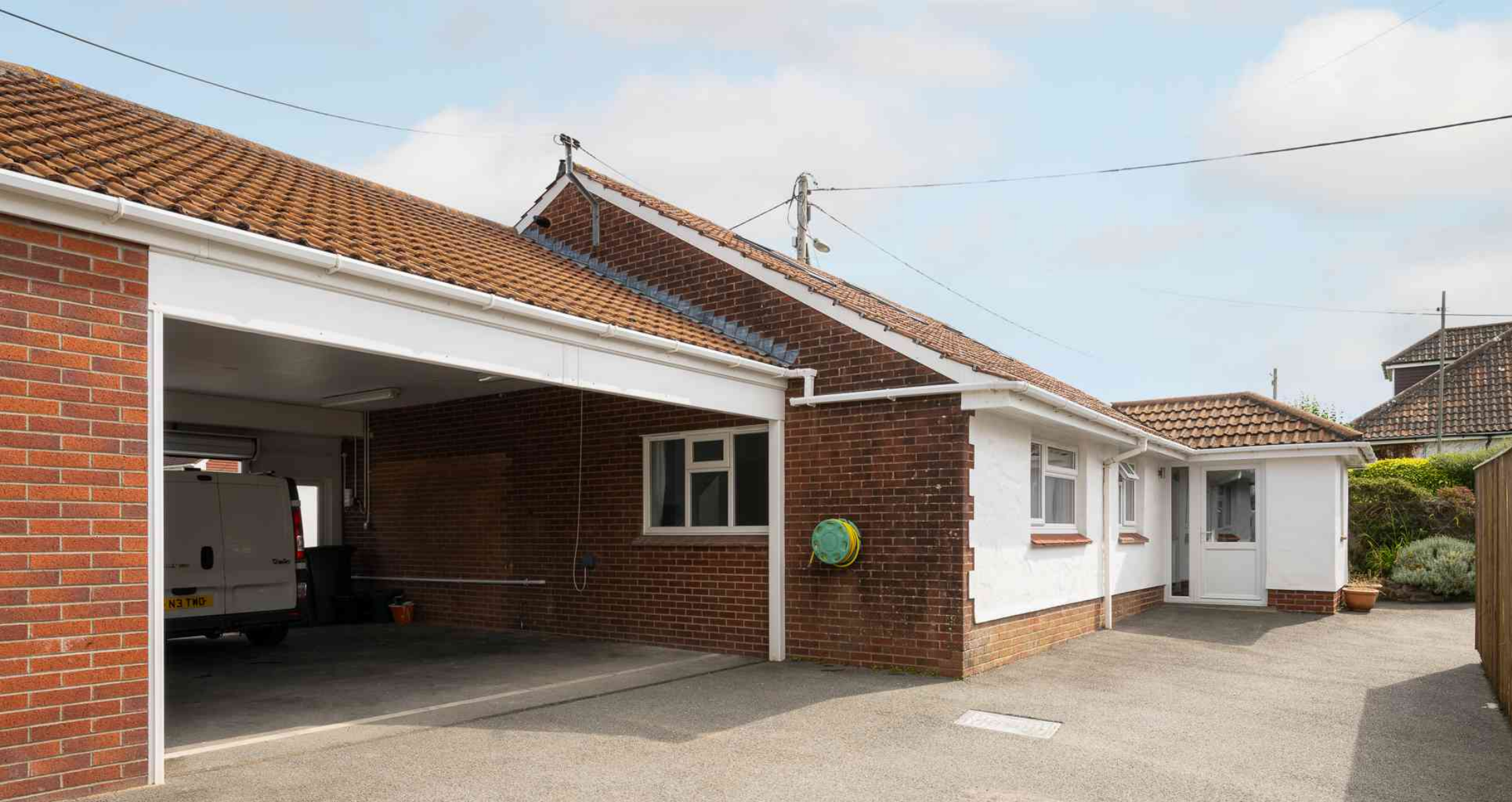
The Lodge and Workshop, Bickington, Barnstaple, Devon, EX31 2JG