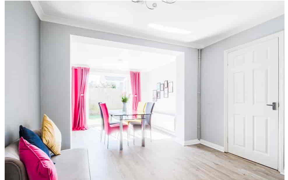
Cavendish Drive, Northampton NN3 3DH Offers Over £300,000 - Freehold