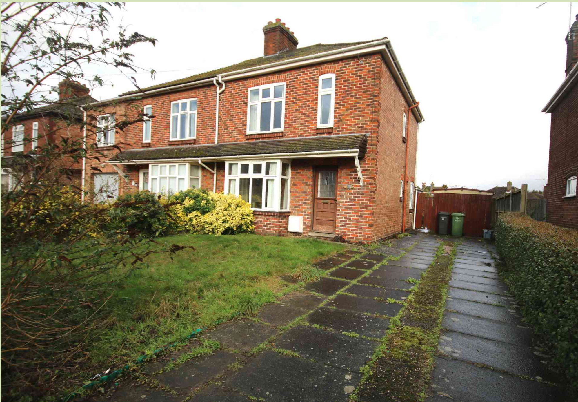
17 St Peters Road, West Lynn Guide Price £205,000