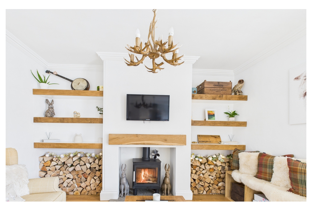
The Common, Crich, Matlock, Derbyshire DE4 5BJ £325,000 - Freehold