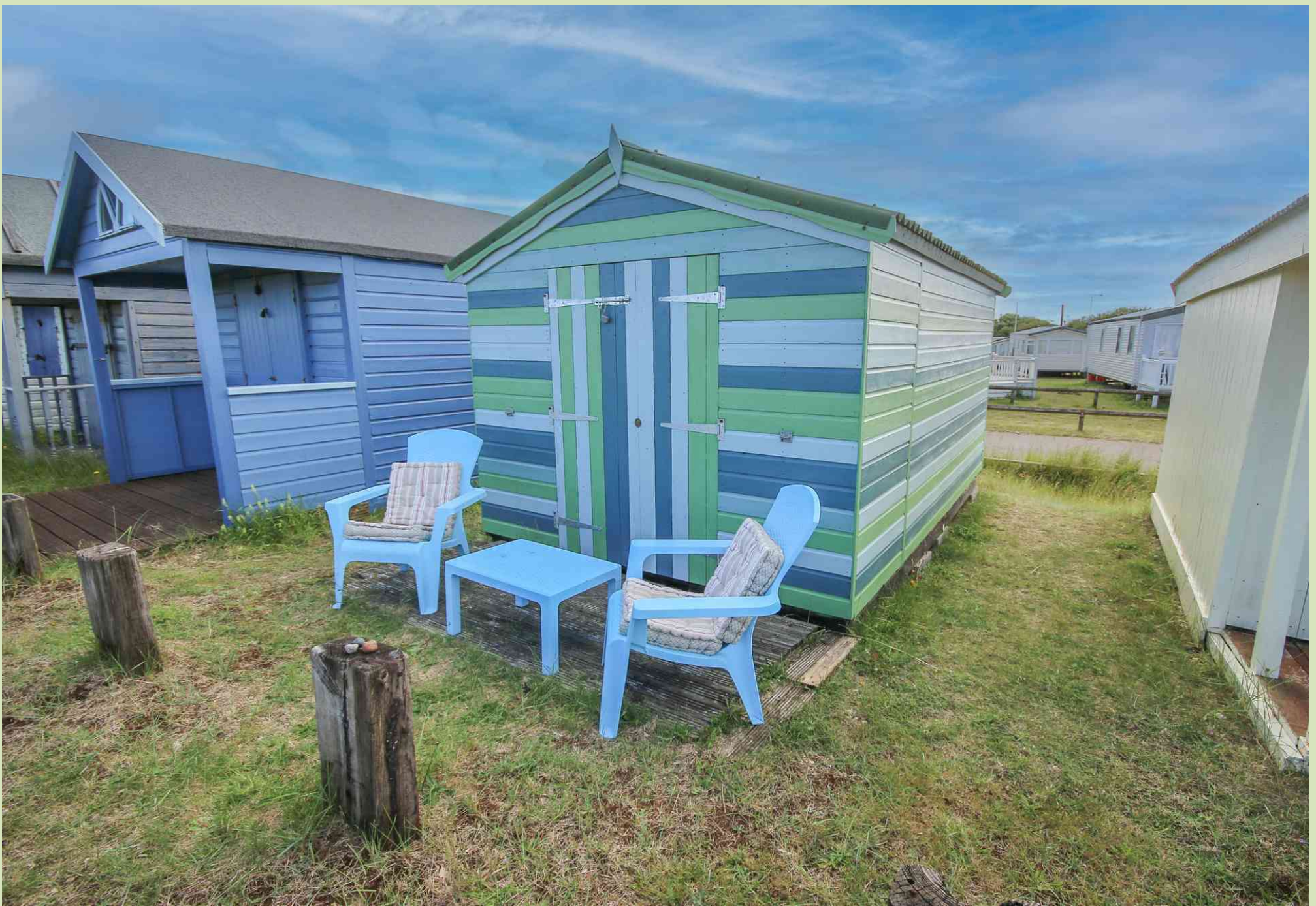
12 North Beach, Heacham Guide Price £16,950