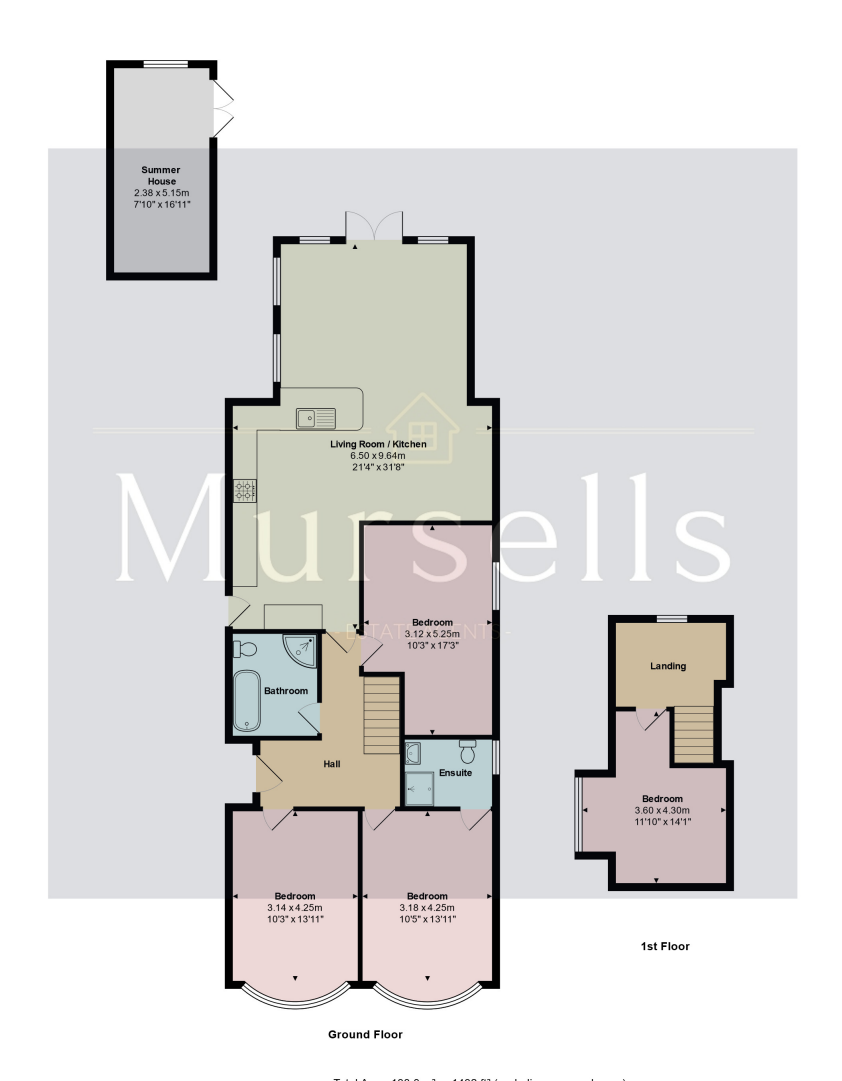
Total Area: 133.0 m² ... 1432 ft² (excluding summer house)