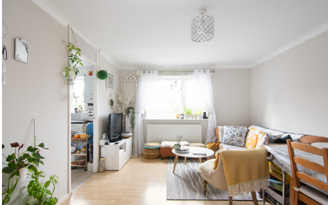
146 Gurney Close, Barking, Greater London. IG11 8JZ.