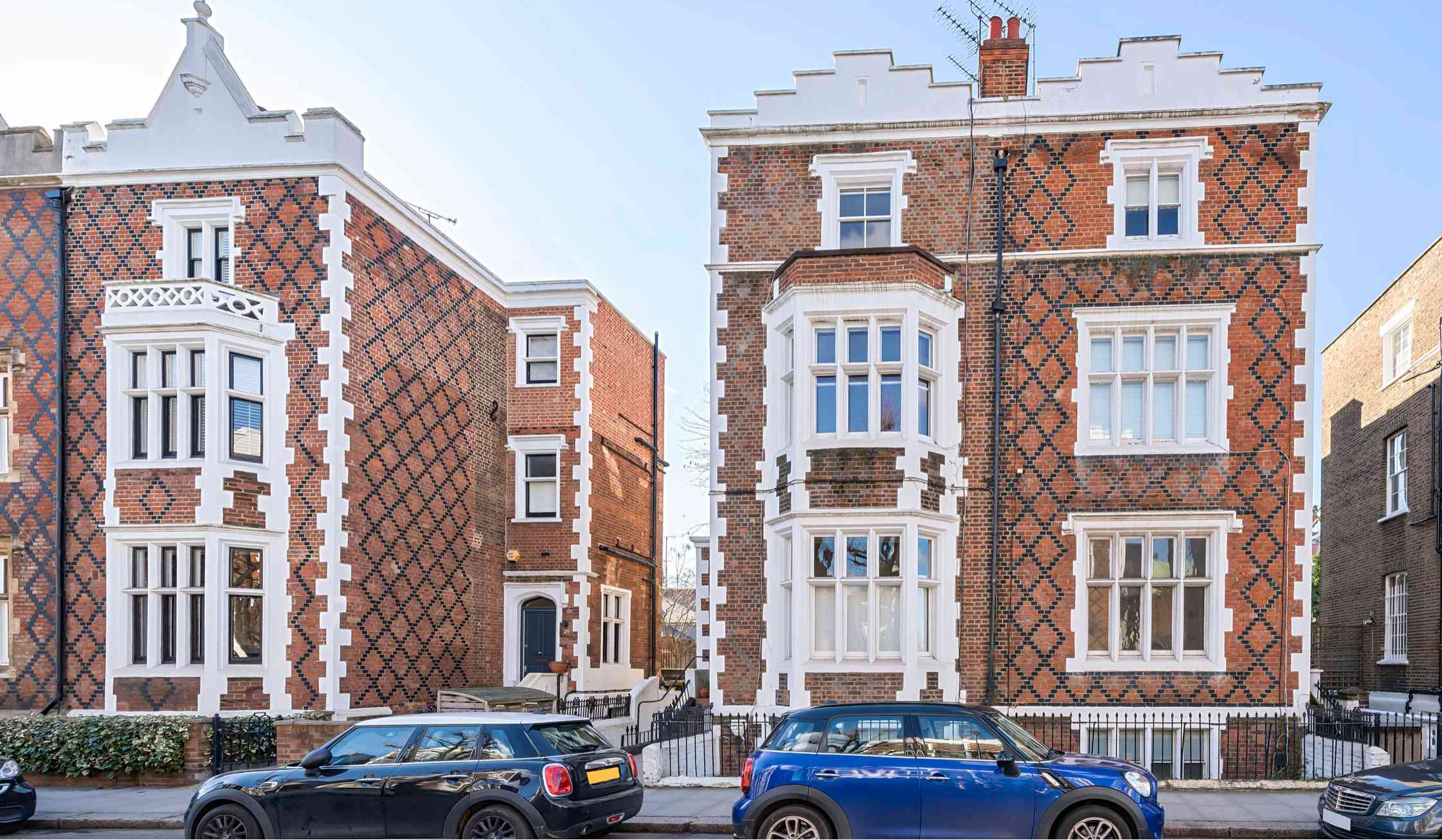
St Anns Villas, London, W11 4RT