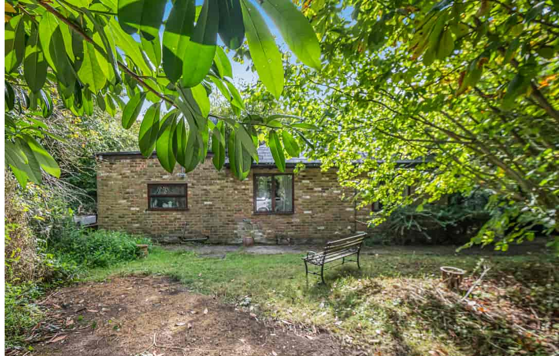
The Paddock, Mundaydean Lane, Marlow, Buckinghamshire SL7 3BU Guide Price £650,000 - Freehold