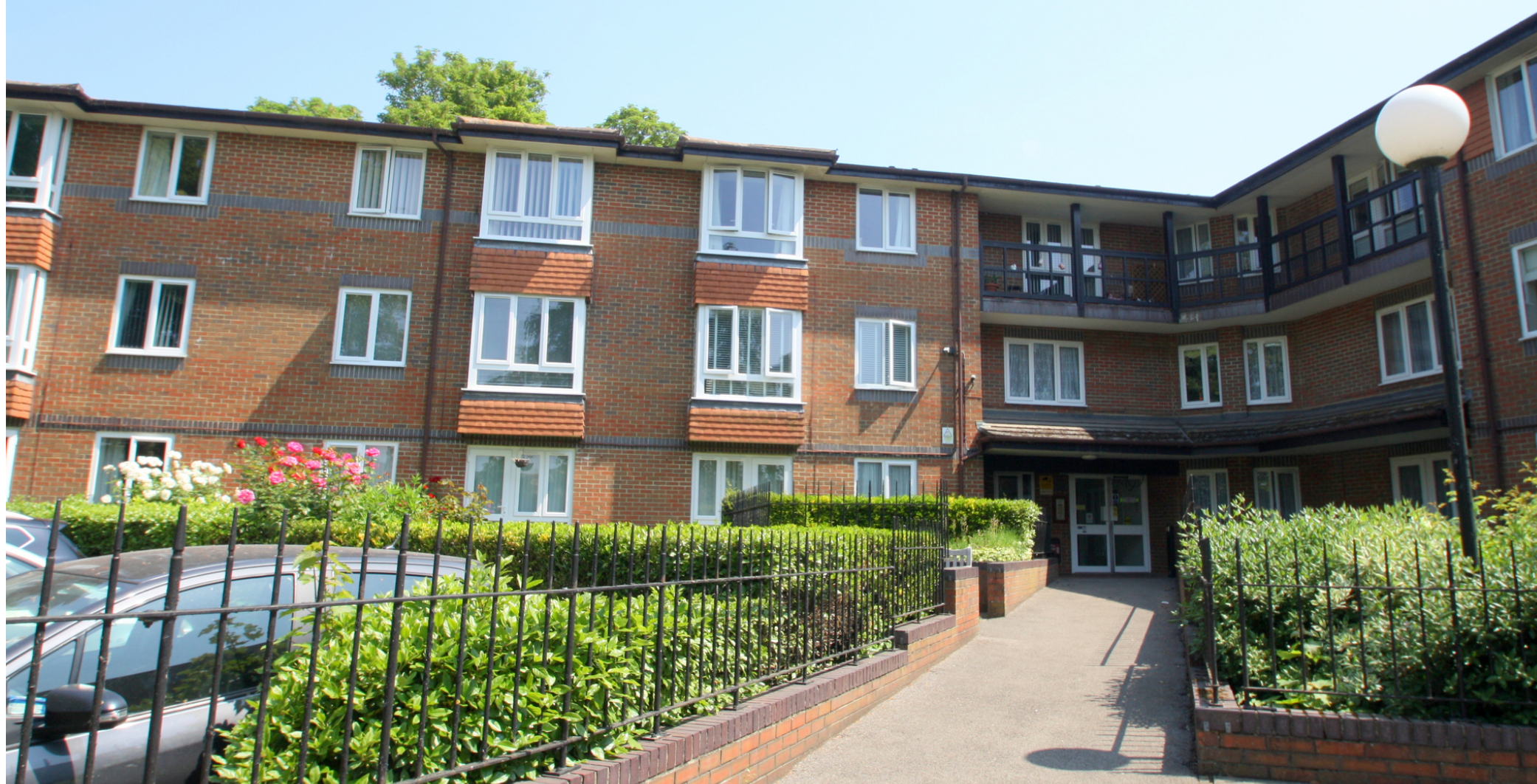
Flat 13 Beech Lodge, Farm Close, Staines-upon-Thames, Surrey. TW18 3EW. 1 Bedroom Retirement Property - £90,000 Leasehold