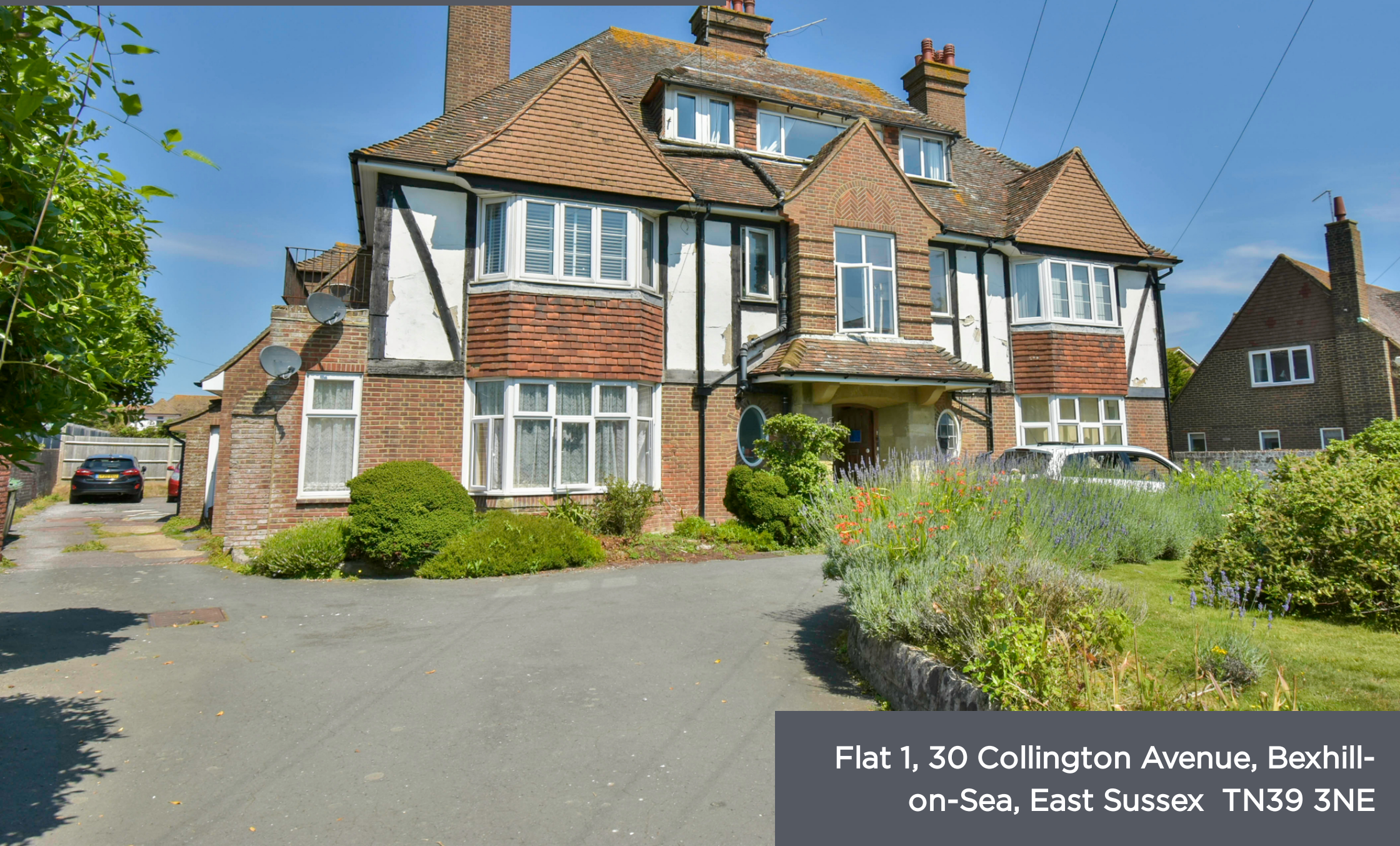
Flat 1, 30 Collington Avenue, Bexhill-on-Sea, East Sussex TN39 3NE