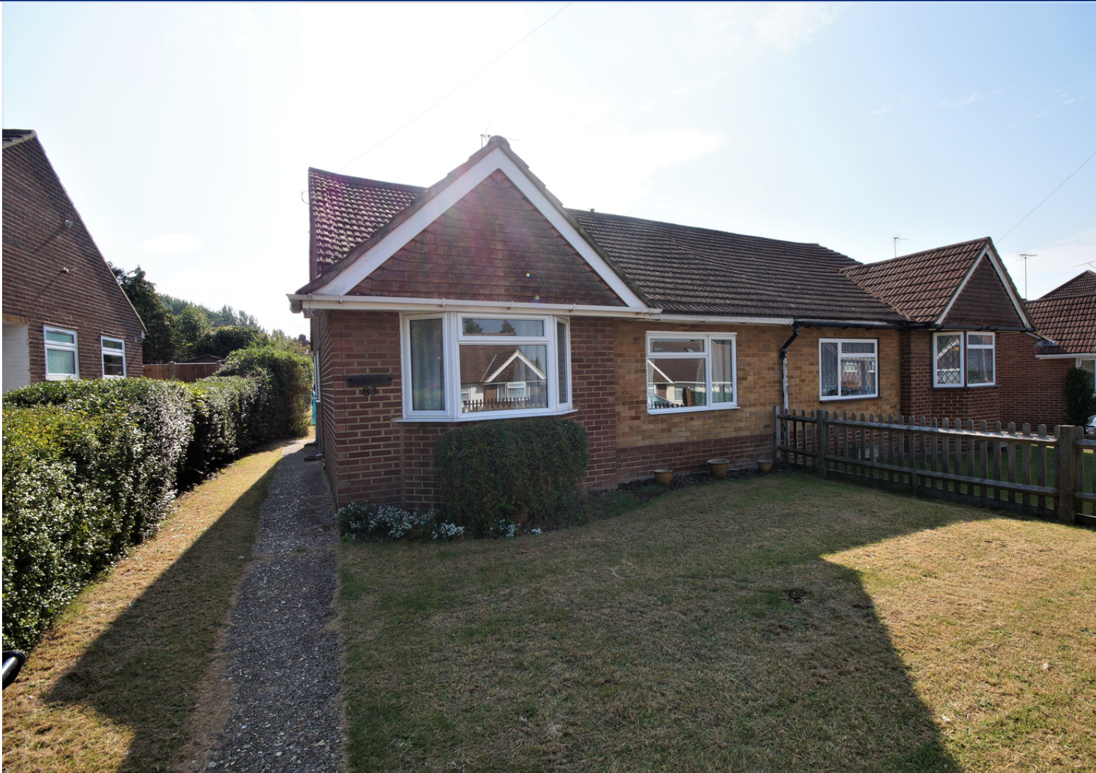
83 Winton Road, Reading, Berkshire. RG2 8HL.